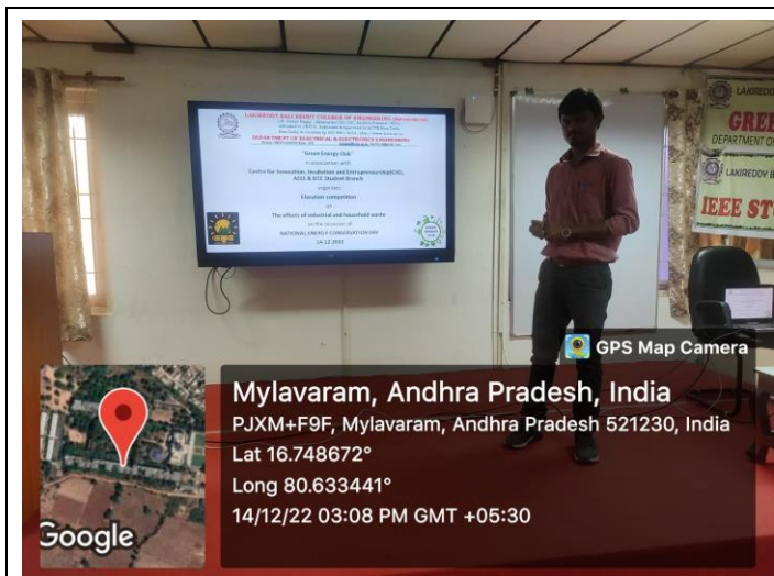
Participant delivering the topic